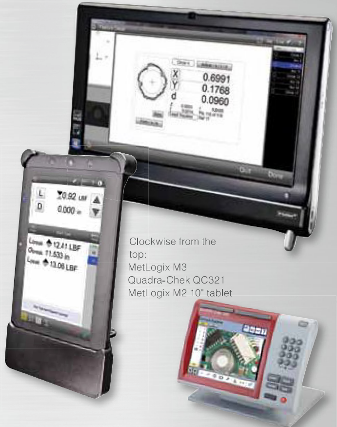
Clockwise from the top: MetLogix M3 Quadra-Chek QC321 MetLogix M2 10" tablet

QUADRA-CHEK QC321/ND1303 Digital Readout. All features of the QC221/ ND1203, but with a larger color touch-screen (8.4"). Supports CNC control and either optical edge detection or video edge detection