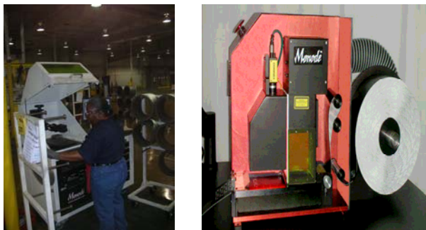
Fiber Marking Lasers with over 50,000 Hrs Rating