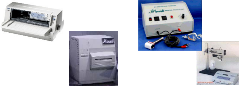
PC Based Stencil Cutting Systems