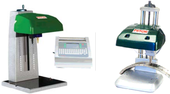
Column Mounted Systems