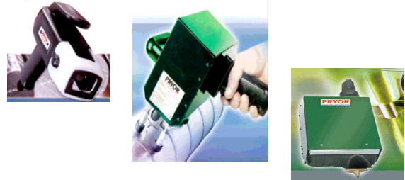
Hand Held & Integrated Units Read / Verification