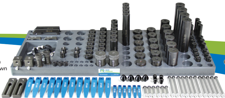
KC-C3B-20 CMM kit shown